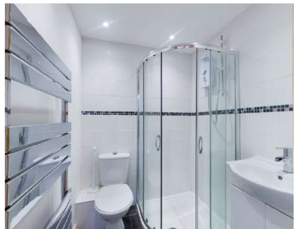
Our photo of the same room