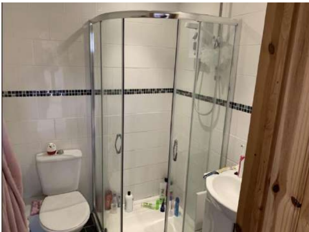
A Leading competitor's photo

At Ridgewater, excellence is included as standard